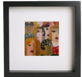
Example of Matted Art