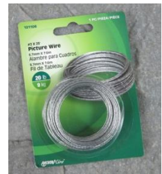
Example of Picture Framing Wire