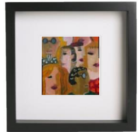
Example of Matted Art